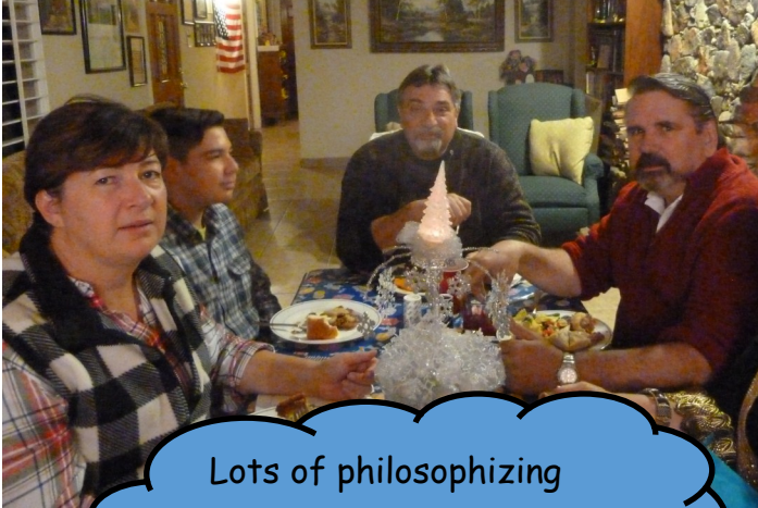
Lots of philosophizing going on at this table